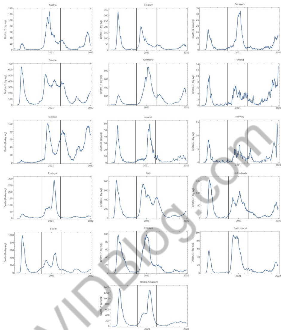
FIGURE 2: Mortality from COVID-19 throughout the pandemic in West European countries.

The area between vertical black bars corresponds to the period analysed in this study (1 October 2020 to 31 March 2021). Data were downloaded on 14 February 2022 from Institute for Health Metrics and Evaluation (IHME).