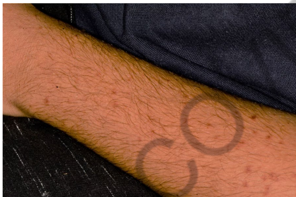
Fig. 10 Multiple erythematous skin lesions

report any change in his usual epilepsy medical treatment, consisting of valproate.