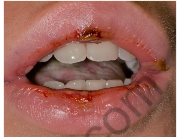
Fig. 14 Squamous-crostous and bullous lesions on the lip's mucosa