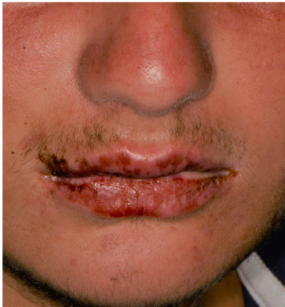
Fig. 9 Erythematous and squamous crusted lesions on lips mucosa and vermillion