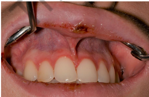
Fig. 18 Erythematous-bullous lesions on the gingival mucosa