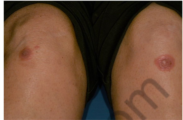
Fig. 6 Typical erythema multiforme target lesions occurring on knees skin