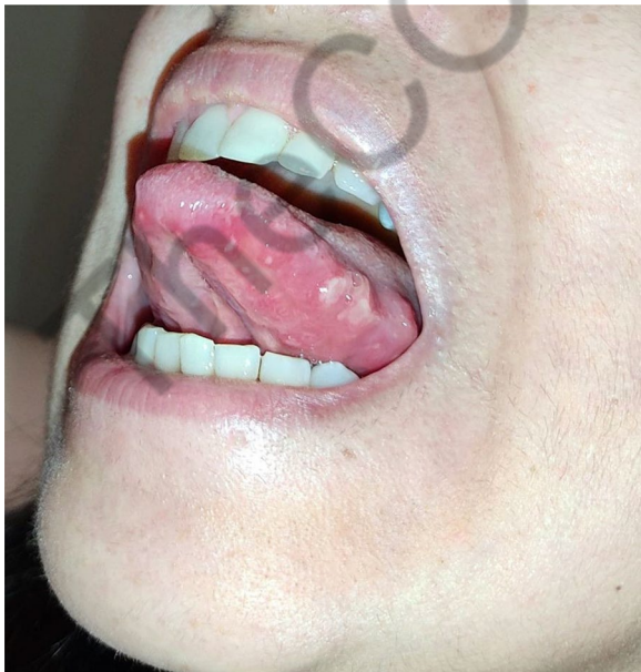
Fig. 13 Multiple bullous and erythematous lesions on the ventral tongue