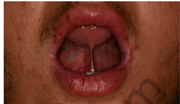
Fig. 11 Improvement of labial and mucosal lesions after prednisone treatment

When the patient presented to our attention, he was prescribed with prednisone 25 mg p.o. a day tapering the dosage, in association to topical 0.05% clobetasol propionate ointment. After a week of treatment, the patient showed regression of mucosal and cutaneous lesions (Fig. 11).