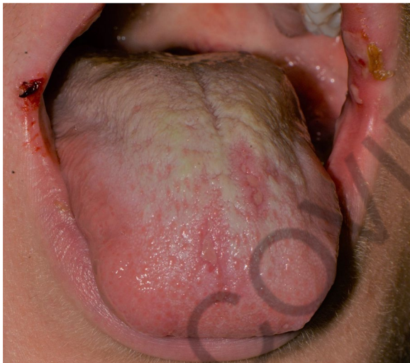
Fig. 17 Erythematous lesions on the dorsal tongue mucosa