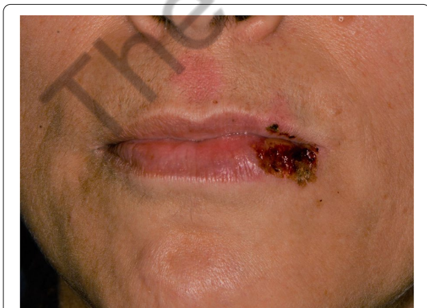
Fig. 1 Squamous crusted lesions and erythematous areas on lips mucosa and vermillion

She has been treated with prednisone 25 mg p.o. a day for 10 days tapering the dosage and topical 0.05% clobetasol propionate ointment. Thereafter discontinuation of corticosteroid-based therapy, a dosage of BP180 and BP230 with the enzyme-linked immunosorbent assays (ELISA) method was asked, to rule out MMP recurrence due to the medical history of the patient. The ELISA test resulted negative. The diagnosis of EM minor was posed. After 10 days of therapy, the lesions disappeared without reoccurrences.