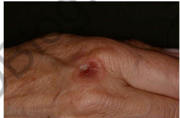
Fig. 7 Typical target erythema multiforme lesion on dorsal hand skin