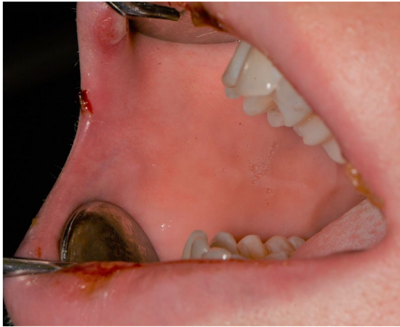
Fig. 16 Bullous and erythematous lesions on the cheek and inner lip's mucosa