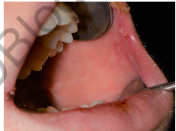
Fig. 15 Bullous and erythematous lesions on the cheek and inner lip's mucosa