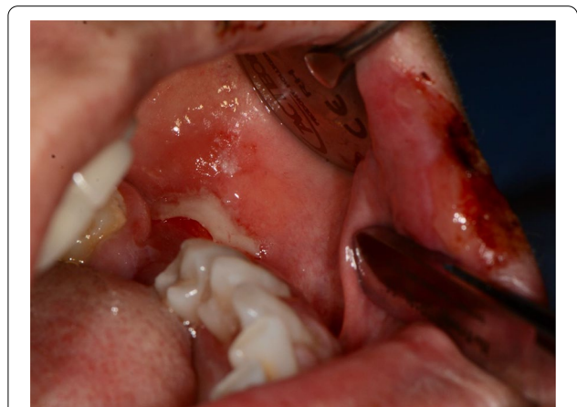
Fig. 3 Bullous-erythematous lesions on the left cheek mucosa