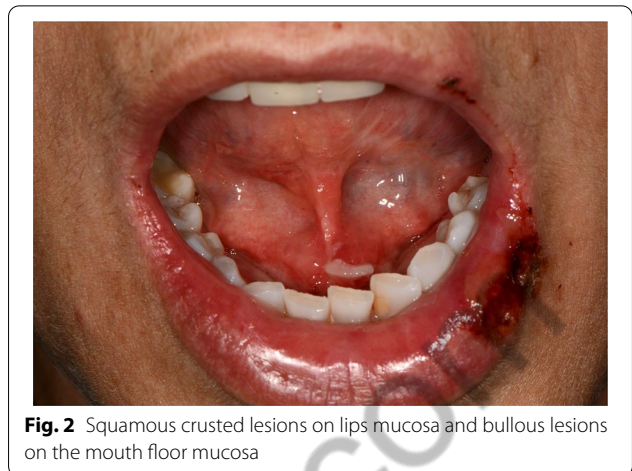
Fig. 2 Squamous crusted lesions on lips mucosa and bullous lesions on the mouth floor mucosa

Later, she also developed oral mucosa's painful erosive lesions, and concentric targetoid plaques on hands, forearms, knees, and heels (Figs. 1, 2, 3, 4, 5, 6, 7 and 8). The genital mucous membranes were not involved. Before the first dose vaccination, the patient was in apparently very good health, with no recent story of herpes labialis and