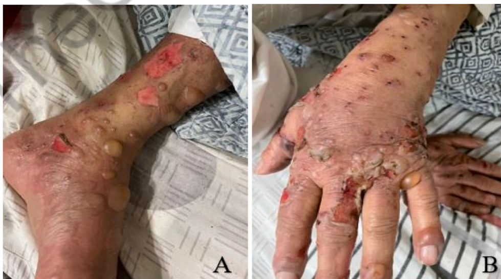
Fig. 1. (A&B): Clinical Picture of multiple intact bullae of variable sizes with ruptured bullae and erosions.

The patient was hypotensive, tachypneic, tachycardic, and febrile (38° Celsius). He was given 2L of standard intravenous saline as well as additional oxygen. On physical examination, there were numerous diffuse erosions, post-inflammatory hyper and hypopigmentation, and crusting (Fig. 4A&B). There were no new blisters or original skin lesions discovered. A laboratory examination revealed a white blood count of 17.2 with a neutrophilic preponderance. He was hospitalized as a case of severe sepsis due to a skin infection, and he began empiric treatment with piperacillin-tazobactam plus vancomycin. Blood and wound cultures grew extended-spectrum beta-lactamase Escherichia coli and Methicillin-resistant Staphylococcus aureus (MRSA), respectively, according to the septic workup. As a result, antibiotics were increased to meropenem and vancomycin. The patient suffered a pulmonary embolism on the second day of hospitalization and was placed on a heparin infusion. He was admitted to the hospital for three weeks to finish the necessary course of antibiotics. He was discharged home after 25 days of prednisolone 20mg daily treatment with a spectacular clinical response, as seen in the statistics (4). Then after one month from discharge patient was found to have died in his bed of an unknown cause but it could be attributed to pulmonary embolism.