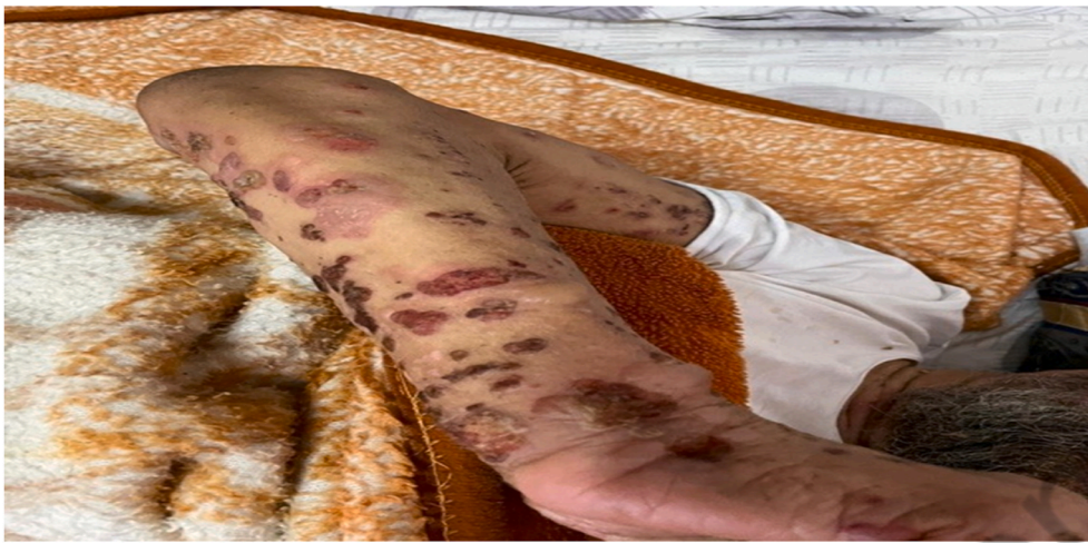
Fig. 2. The significant response after three days of topical steroids.