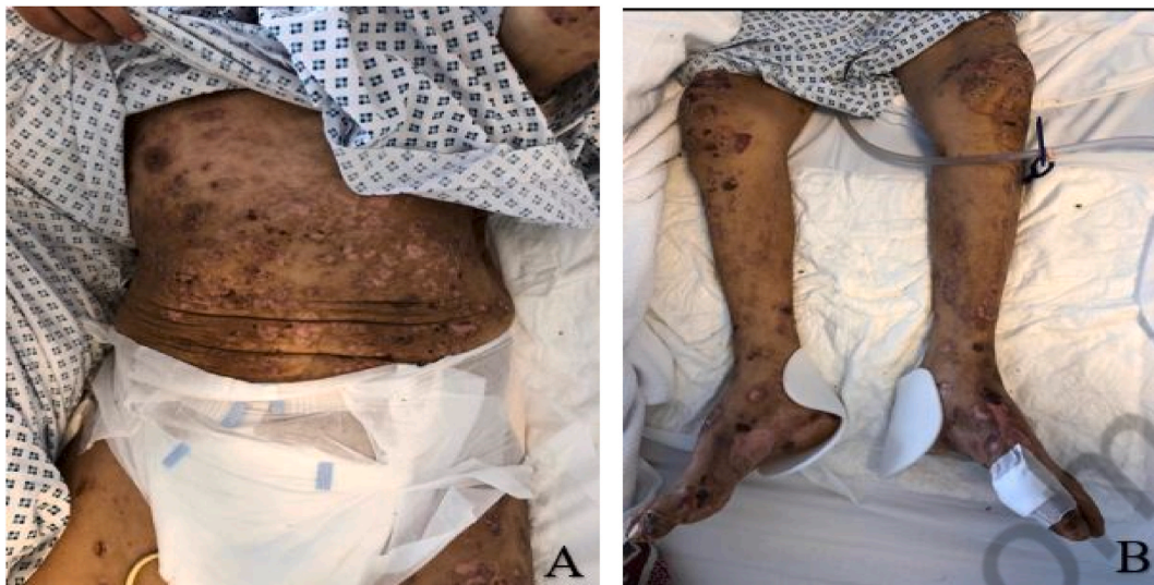
Fig. 4. (A&B): (21 days post Steroid): Clinical Picture of the patient 21 days after the systemic steroid initiation showing excellent improvement with no new bullae in addition to multiple healed erosions, post-inflammatory hyper-, and hypopigmentations.