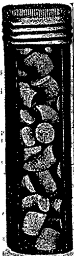
Medicated Cartridges (patented)

Stop suffering. Try this new invention which has already proven successful in thousands of cases. Remember you take absolutely no risk. Mail the coupon NOW and in a few days you will write us as nice a letter as you will find in the panel at the right. Mail the coupon before you forget. Don't let delay rob you of the relief Breathe O Tol brings.