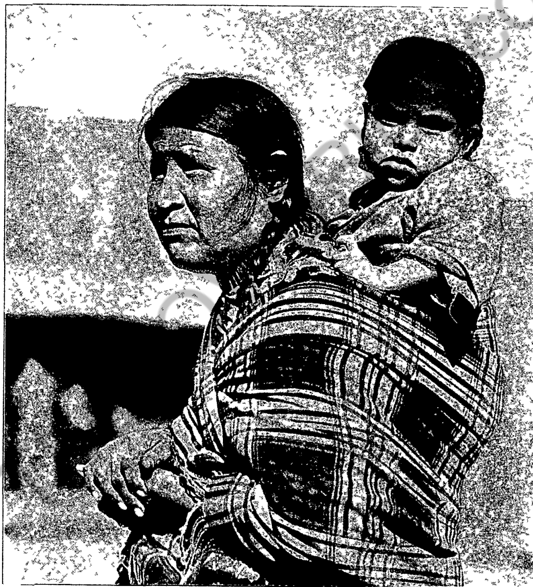
A REAL AMERICAN MOTHER—SIOUX INDIAN